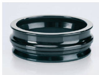
The THERMO 800 spinning ring is recommended especially for spinning core yarns for sewing threads and Denim yarns.