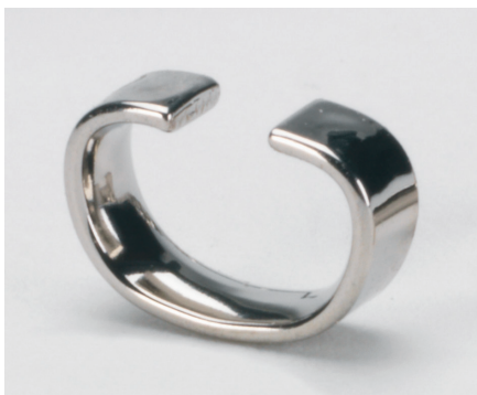
STARLET plus - the traveller for challenging spinning conditions