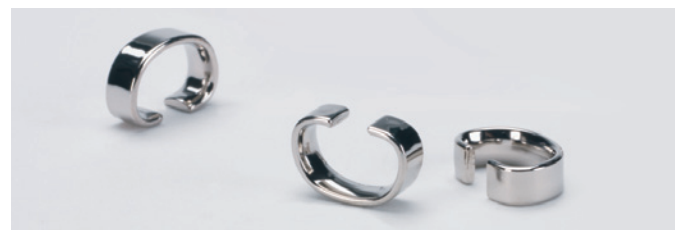
STARLET traveller – optimal resistance against corrosion. Electrolytic surface treatment (special nickel plating).