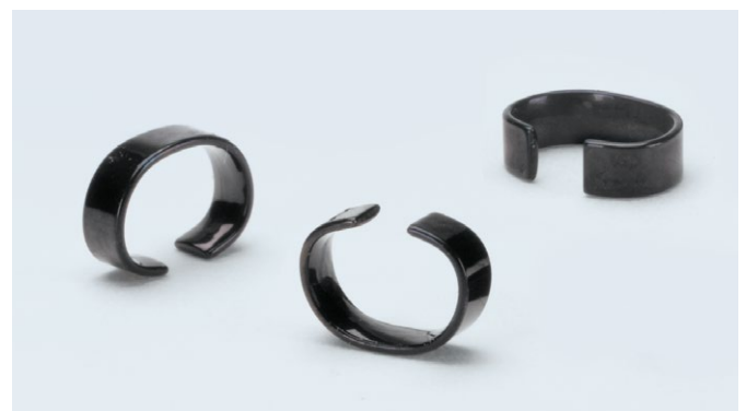
CARBO – the travellers for highest demands